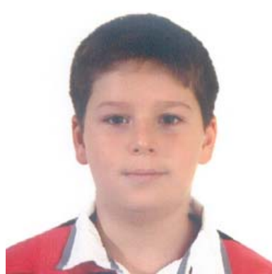
BORA BİRLİKÇİ CCS 68.15